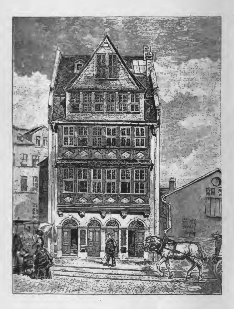
THE OLD HOUSE IN FRANKFORT.