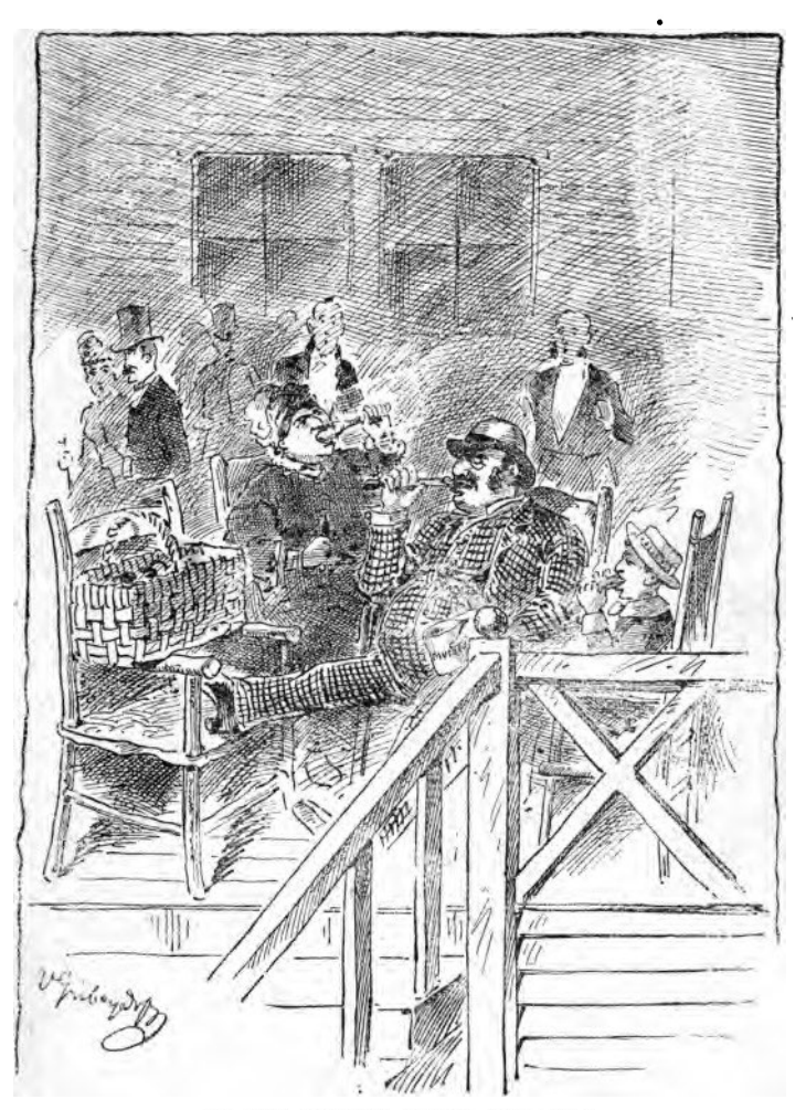
ON THE SUMMER-HOTEL VERANDA.