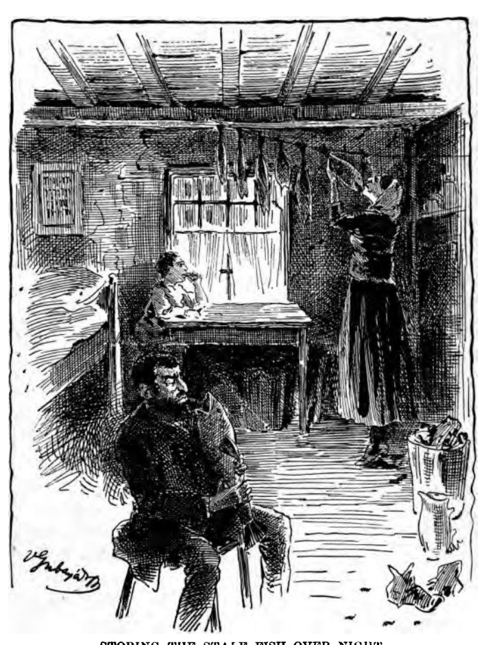
STORING THE STALE FISH OVER NIGHT.