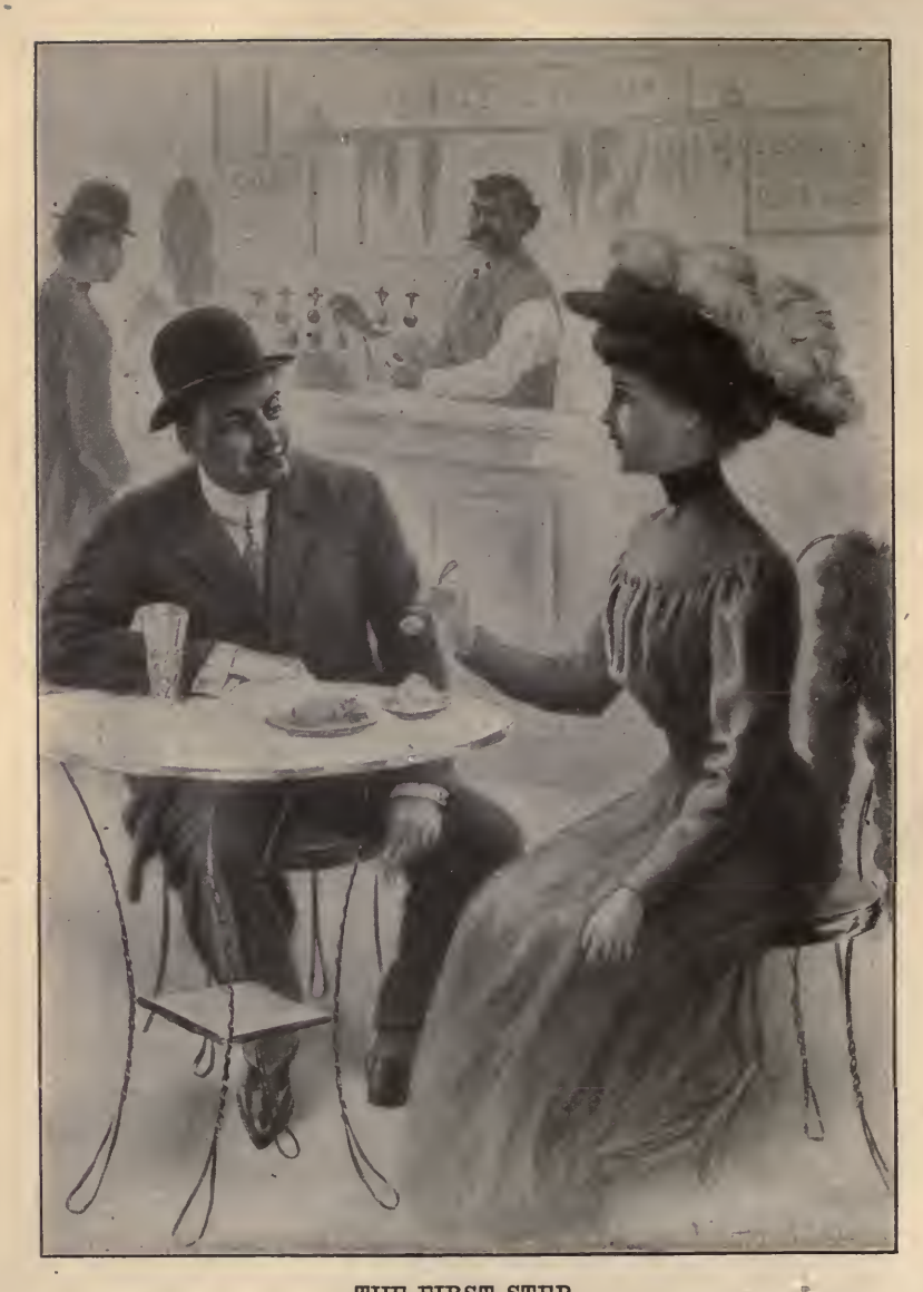
THE FIRST STEP. Ice cream parlors of the city and fruit stores combined, largely run by foreigners, are the places where scores of girls have taken their first step downward. Does her mother know the character of the place and the man she is with? (See page 71.)