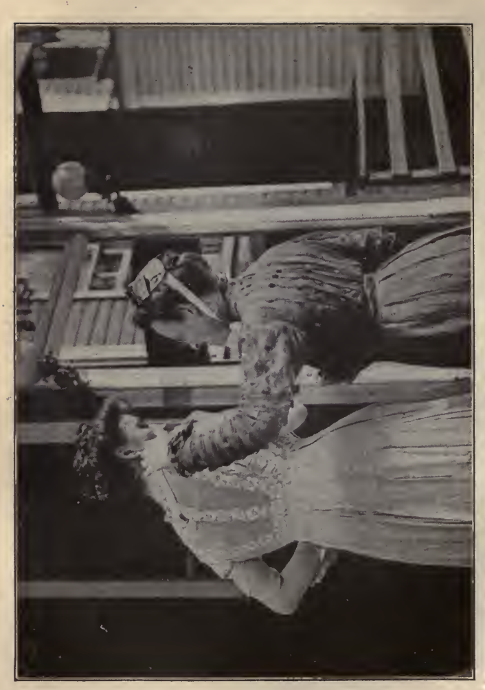
"COME WITH ME, SISTER-THERE IS HOPE FOR ALL" One who has answered the cry, "For God's sake, do something"