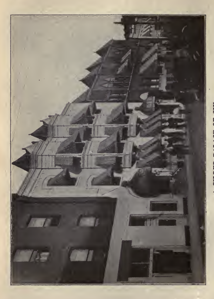
A GILDED PALACE OF SIN Showing the gay and attractive front entrance where the white slave trader sells young girls into a life of shame.