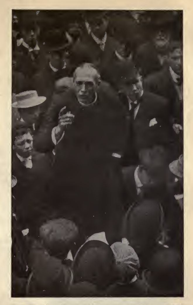
BISHOP OF LONDON PREACHING IN WALL STREET NEW YORK

The best loved man in England. He preaches in the slums at midnight, and in his cathedral he pleads with the leaders of his church and nation against the false modesty which keeps young people in ignorance of the wages of sin.