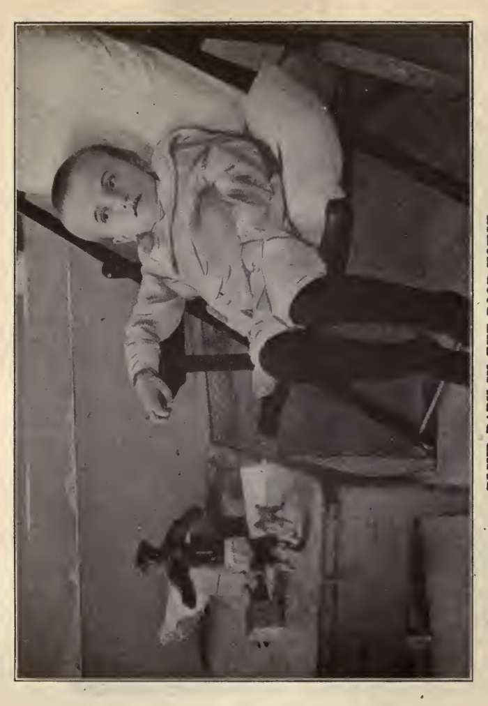
This baby's condition is the direct result of disease in the parents. Probably 25 per cent of the blindness of children is caused by illicit sexual relation. (Dr. Wm. T. Belfield, page 299.)