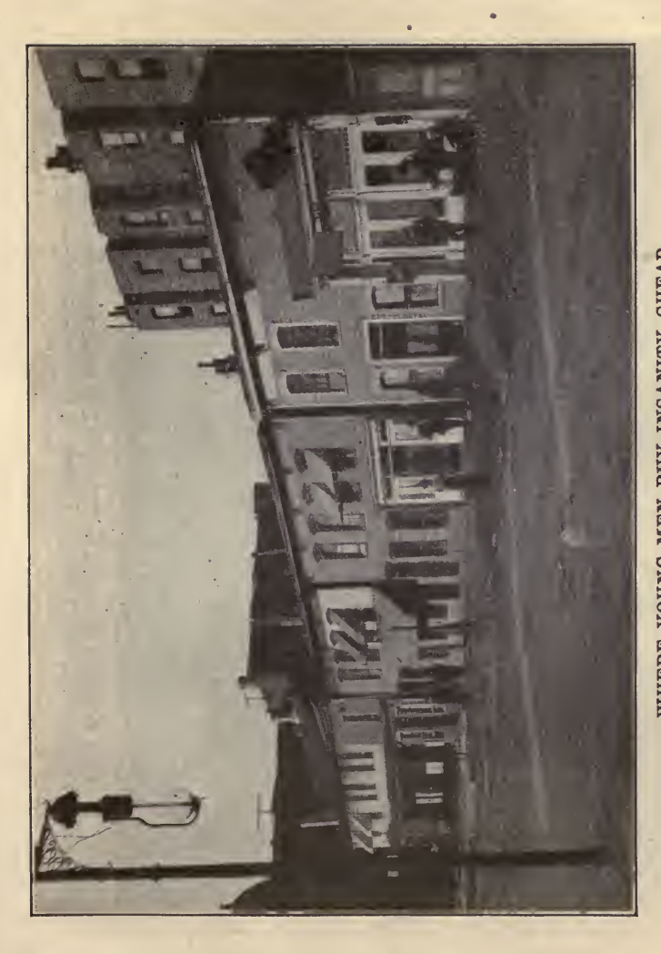
A whole row of low dives and vice resorts. It is here that the white slaves are taken; it is here where the sinful pleasures of the young men wreck their bodies and steal their manhood.