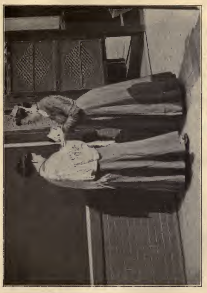
AT WORK IN THE VICE DISTRICT—AT THE VERY DOOR OF A DEN In some cities the charitable organizations have missionaries whose work is among the denizens of the vice districts. This picture shows one of them pleading with a lost one to give up her sinful life.