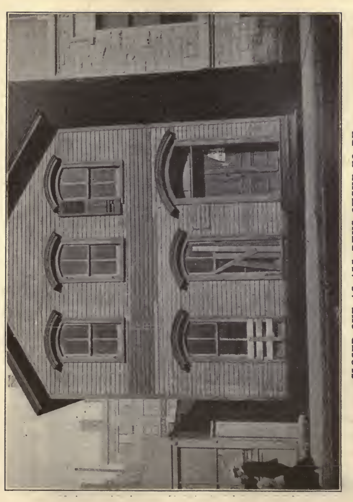
CLOSED OUT AS ALL DENS OUGHT TO BE Formerly a notorious resort containing many white slaves. Now closed, as a result of the fight against the traffic in young girls