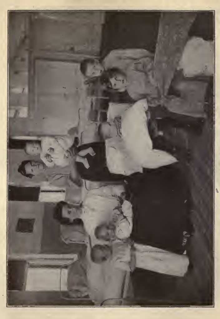
DISEASED CHILDREN IN THE POOR-HOUSE Scores of children suffering from disease are to be found in the charity hospitals. The white slave trade is to blame for this state of affairs