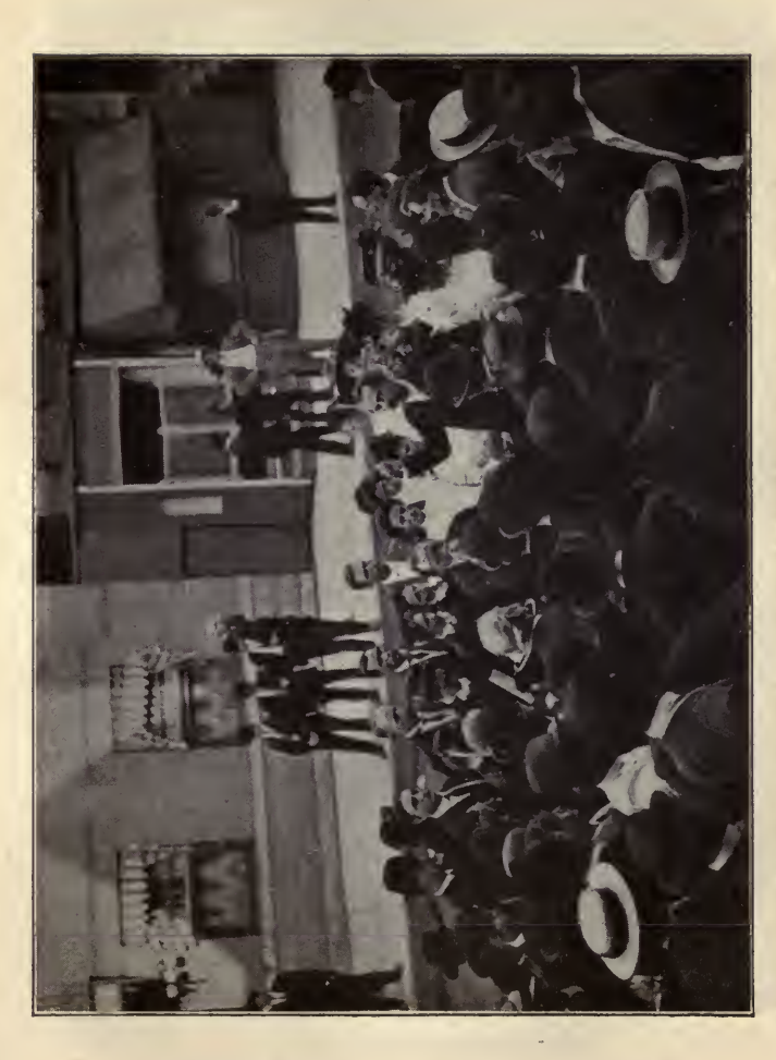
DENOUNCING THE POLITICIANS WHO PROTECT THE DIVES The author and his band of noble workers fighting the evil in the very heart of the vice district