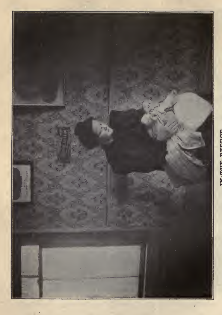
Alone in the world with no one but her baby she comes to the refuge to save herself from starvation. She has no husband. She was tempted and fell