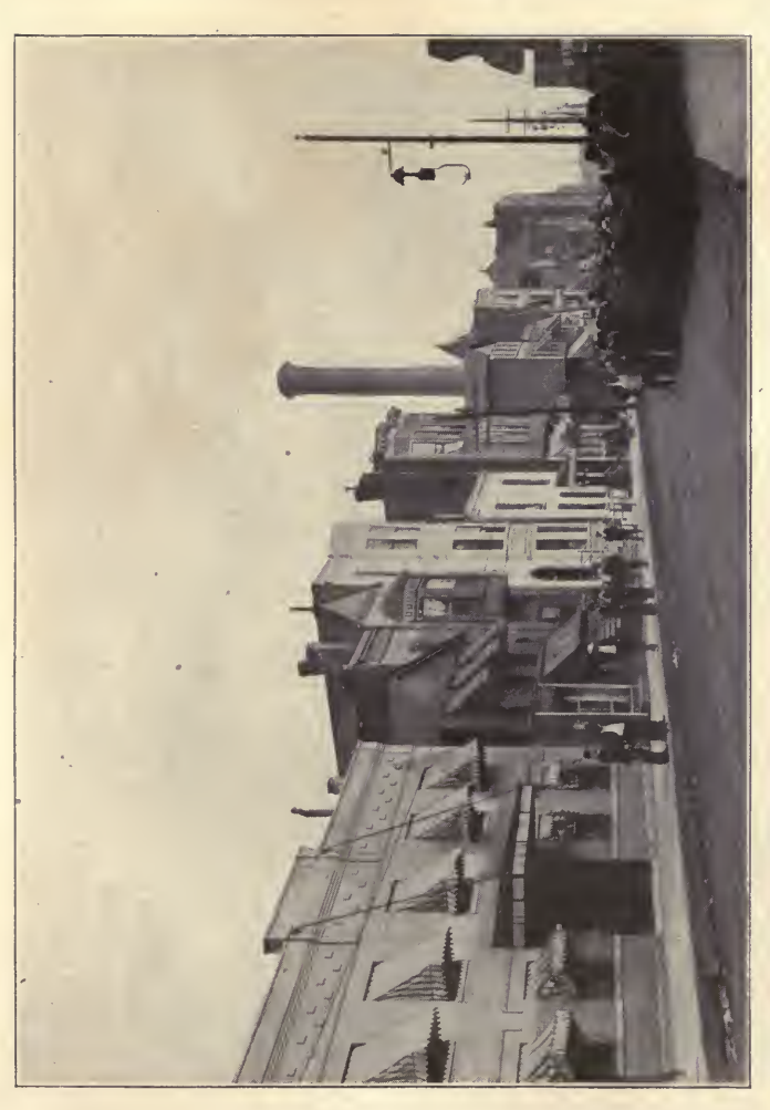
AT THE LEFT WHITE SLAVE CLEARING HOUSE, AT THE RIGHT GOSPEL MEETING That the white slave organization is strong and wealthy is attested by the large stone and brick building on the left. It is the respectable appearance of the outside of this place that disarms suspicion until the girls are inside.