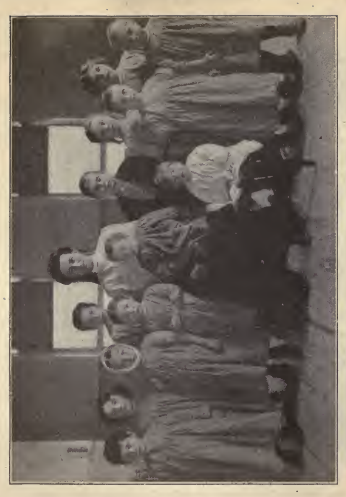
IN THE HOSPITAL—SINS OF THE FATHERS VISITED UPON THE CHILDREN These poor mites of humanity are brought into the world with the double handicap of poverty and disease—a charge upon the county