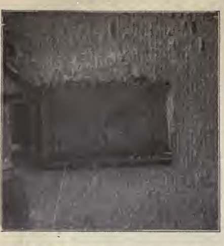
No state prisor is more securely barred than was this house where many white slaves were kept. This dive was a rendezvous for thieves and other disreputable characters. BARRED WINDOW AND DUNGEON DOOR