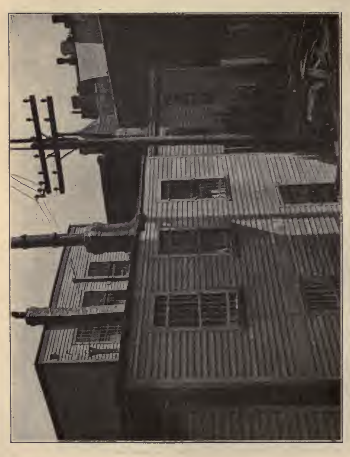
BARS WERE REMOVED BY ORDER OF THE CHIEF OF POLICE Until quite recently the back and side windows of vice resorts were barred like a prison, and one of the first steps in this crusade was to get the chief of police to remove them.