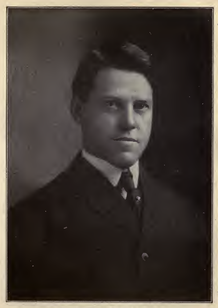
HON. CLIFFORD G. ROE