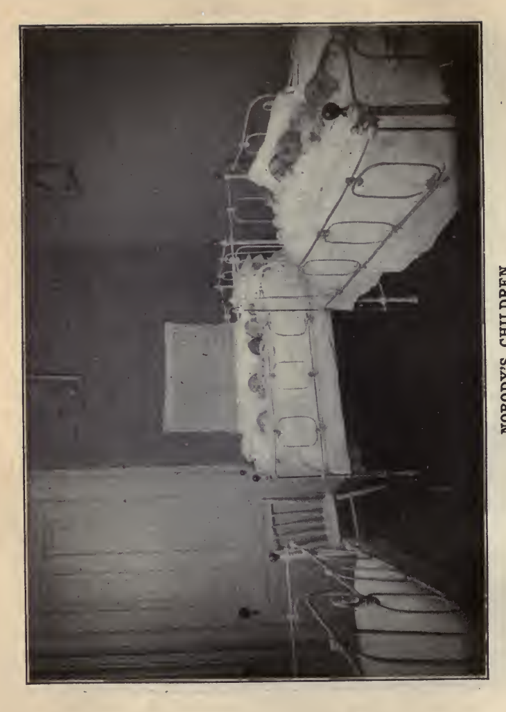
NOBODY'S CHILDREN Can you imagine anything more pitiful? The result of the white slave traffic No father-no mother-no name.