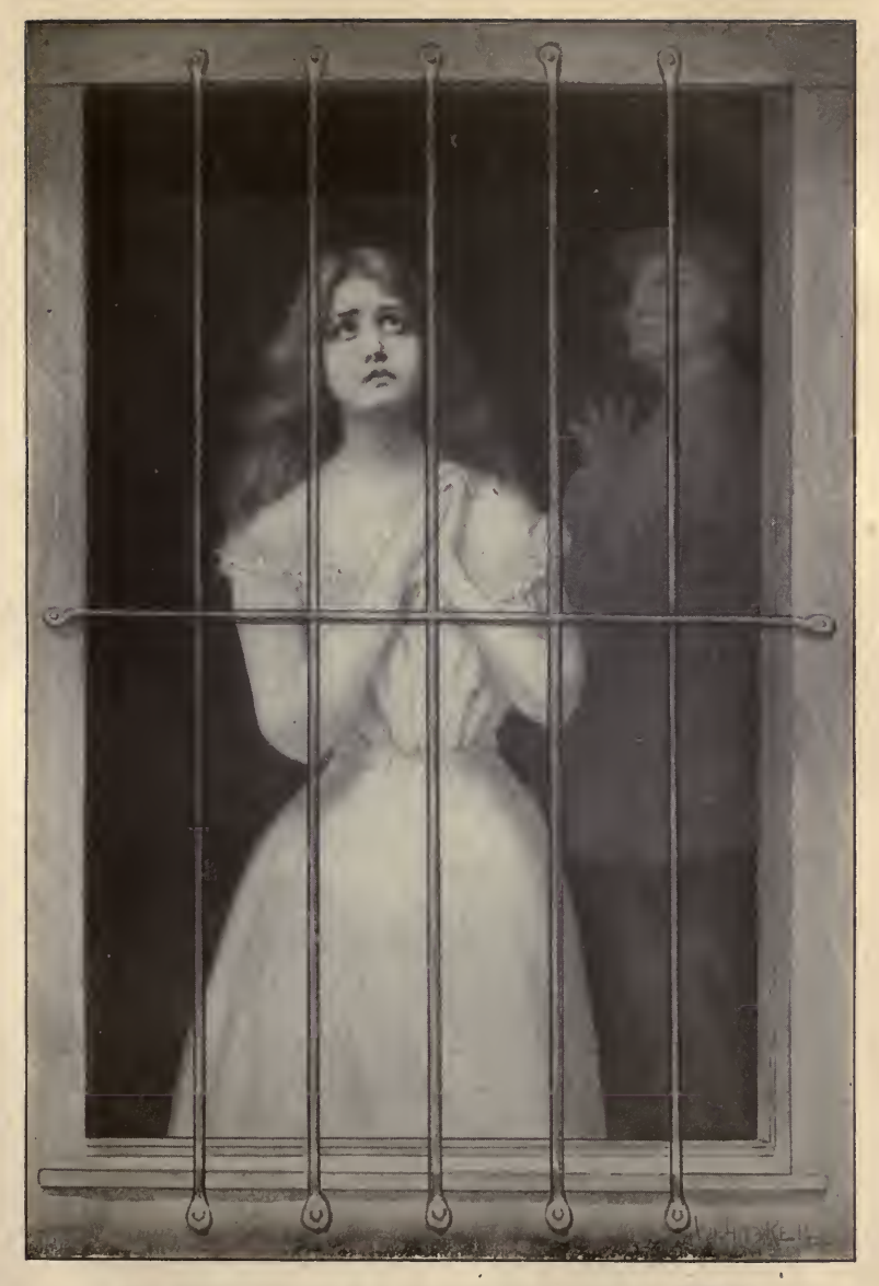
"MY GOD! IF ONLY I COULD GET OUT OF HERE." The midnight shriek of a young girl in the vice district of a large city, heard by two worthy men, started a crusade which resulted in closing up the dens of shame in that city. (See page 450.)