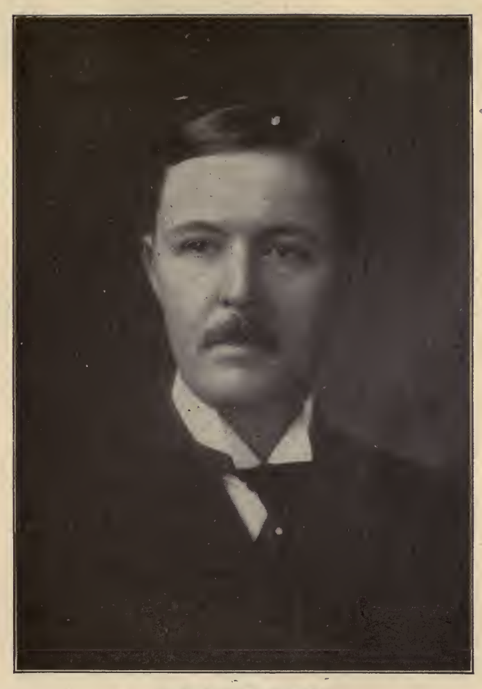
HON. EDWIN W. SIMS The man most feared by all white slave traders