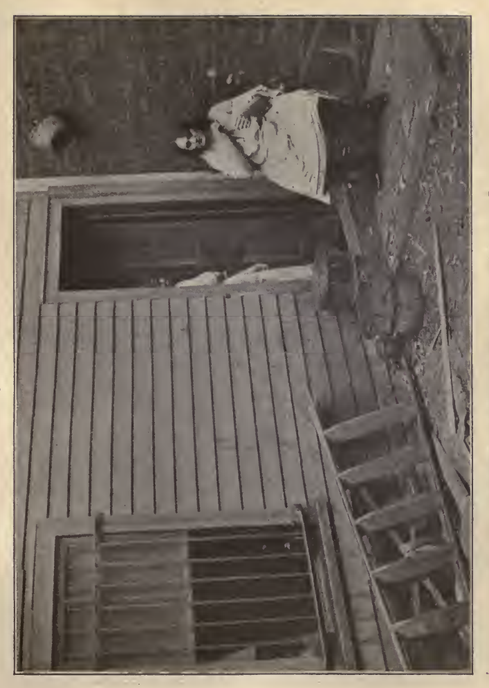
"THE GILDED LIFE" AS IT REALLY IS All the fresh air these poor slaves get is in the back yard of the dives, which is full of refuse, and where they are watched by colored attendants