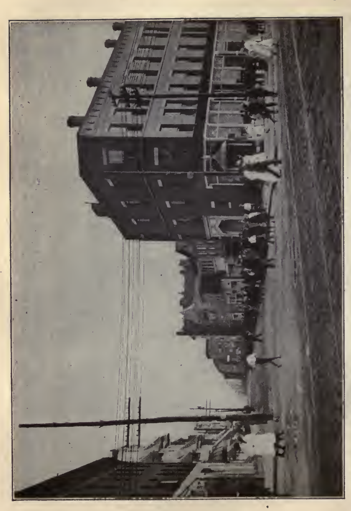
HUNDREDS OF CHILDREN MUST WALK DAILY THROUGH THIS INFERNAL REGION One of the streets in the vice district showing the school children passing the doors of these awful dens of sin and shame